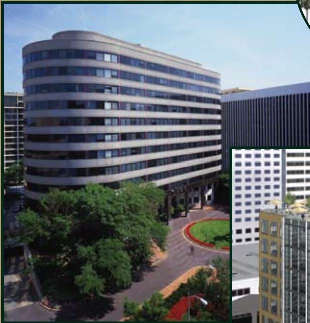
1525 Wilson • Arlington, VA