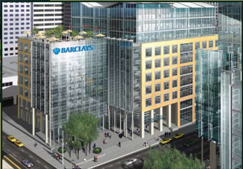
Foundry Square • San Francisco, CA