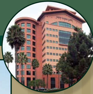
Aventine • San Diego, CA

400 South El Camino Real San Mateo, California 94402 Tel: 650 343 9300